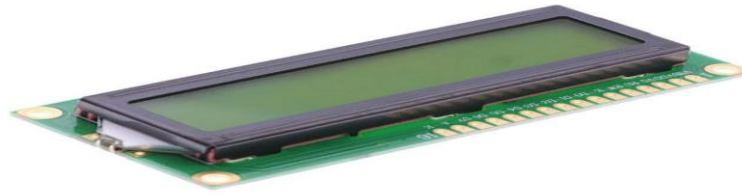
Figure 4: LCD Display Module