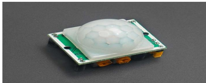
Figure 2: PIR Sensor

PIR sensor(s) illustrated in Figure 2 are used for occupancy detection. They sense infrared radiation emitted by human bodies and generate signals when motion is detected. These sensors enable the system to determine whether a room is occupied, thereby facilitating intelligent control of appliances.