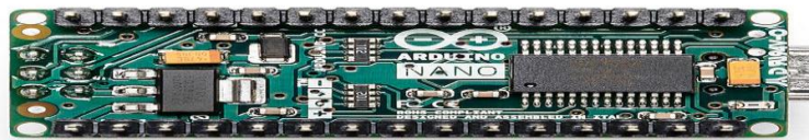
Figure 1: Arduino Nano Board

The Arduino Nano illustrated in Figure 1 serves as the central processing unit of the system. It is responsible for receiving input signals from sensors, executing the control algorithm, and generating appropriate output signals to control connected electrical loads. The Arduino Nano was selected due to its low cost, compact size, ease of programming, and sufficient processing capability for real-time applications.