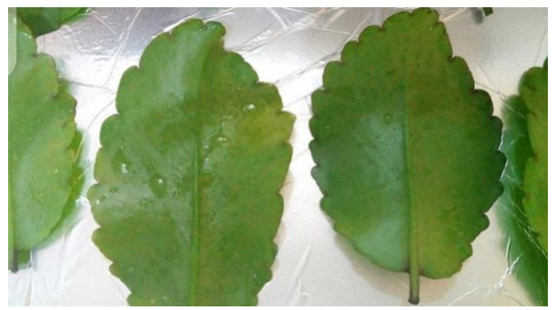
Figure 1: Leaves of B. pinnatum

the antimicrobial assay (Table 1) shows that the fungal extract (1 mg/mL) displayed a broad spectrum antibacterial activity with inhibition zone diameters (IZD) in the range of 14 - 16