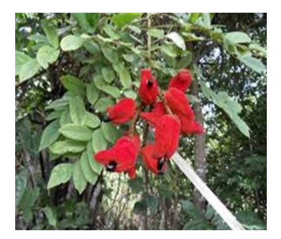
Fig 1. Picture of C. ferruginea in it's habitat.

This research was designed to evaluate the antimicrobial and antioxidant properties of Cnestis ferruginea leaves extract on bacterial and fungal isolates. The study aimed to determine their minimum inhibitory concentration (MIC), the phenolic and flavonoids content of the leaf extract, and the phytochemical properties of the leaf extract so as to offer informed recommendation on its use for disease management and to curb antibiotic resistance cases.