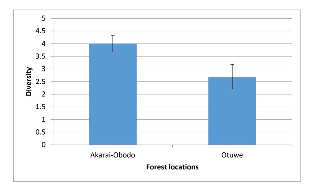
Fig 3 Species diversity of the different forest sites