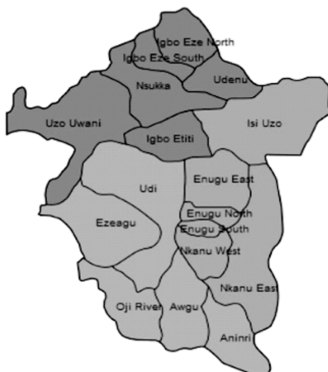
Figure 1: Map of Enugu State Showing the 17 Local Government Areas [18]

Study Area: This cross-sectional study was conducted in Enugu State of Nigeria. The State is one of the states in Nigeria's southeastern region. It has 17 LGAs and a total population of 3,267,837 people [16] . Fourteen (14) of the seventeen (17) LGAs are primarily rural. Some urban towns are concentrated primarily within the State capital. The state's economy is predominantly rural and agrarian, as it is mostly covered by open grassland with occasional woodlands and clusters of oil palm trees. Farming employs a sizable proportion of the working population, but trading (18.8 percent) and services (12.9 percent) are also important [17] . Enugu State and other states in Southeastern Nigeria are commonly referred to as Igbo land because the people are primarily Igbos with distinct ingenious characteristics. Due to the abundant rainfall in the