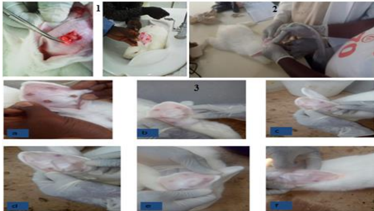
Plate II: Wounding of rabbit ear to the dermis to create scar (1); Using ultrasound in monitoring of scar progress in rabbit (2); Progress of scar during dermal administration of extracts, a = post-wound 1 week, b = post-wound 2 weeks, c and d = post-wound 3 weeks, e and f = post-wound 4 weeks (3)

A = Rabbit Dermal Jacket, B = Dermal Area for Application of Drug and Extract, C and D = Scar Creation and E = Rabbit Ear Scar Development